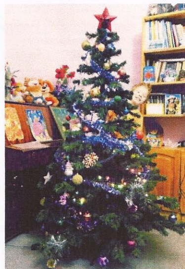
It is our Christmas tree!